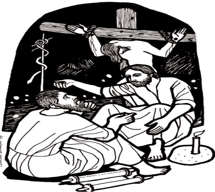
Christ, the Redeemer

"God sent his Son so that through him the world might be saved." We can become so familiar with a sentence like this that we miss the profound truth in it of how much God loves us and longs for us. We think of faith as meaning our belief in God. It is much more about God's intense belief in us and in our goodness and beauty and he wants us to come to a knowledge of that too. We have a serious responsibility to one another of constantly bringing that knowledge to each person in every way we can. One of the major tasks for every married couple is to help each other to know how much they are loved and treasured. This is done through affirmation and affection. Parents have this same responsibility towards their children. They can help each one be a truly successful human being by building up their goodness. And in the parish community we help one another by looking out for each other.