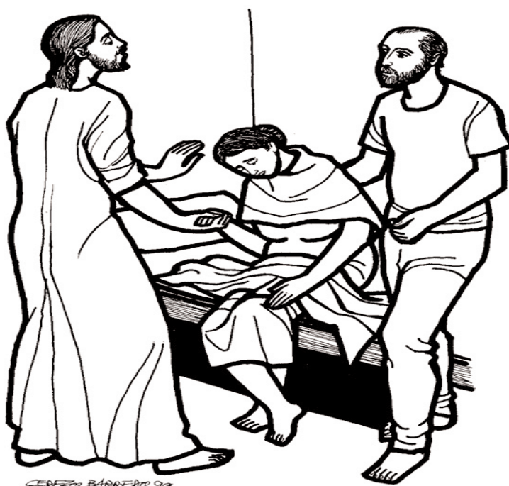
Christ who heals us

"The fever left her and she began to wait on them." One of the lovely features of the Gospels is the number of healing stories they contain. Nothing is too big or too small to bring to Jesus. He raised Lazarus from the dead; he healed Peter's mother-in-law from a fever. That same Jesus is with us and among us with the same power and the same longing, to heal us into wholeness. All we have to do is ask him for what we need for ourselves and for one another and know that he will answer. We all need his healing power in so far as we set limits to our love for one another because his great commandment is to love. Husbands and wives often need to stretch their love into forgiveness if they are to go forward together. Parents need to grow in understanding of their children. And in our parish we need Christ's power to help us to take true responsibility for those in need.