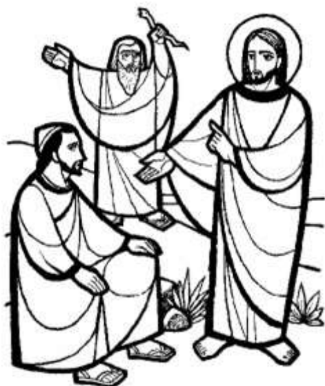
Christ, the Redeemer

"God sent his Son so that through him the world might be saved." We can become so familiar with a sentence like this that we miss the profound truth in it of how much God loves us and longs for us. We think of faith as meaning our belief in God. It is much more about God's intense belief in us and in our goodness and beauty and he wants us to come to a knowledge of that too. We have a serious responsibility to one another of constantly bringing that knowledge to each person in every way we can. One of the major tasks for every married couple is to help each other to know how much they are loved and treasured. This is done through affirmation and affection. Parents have this same responsibility towards their children. They can help each one be a truly successful human being by building up their goodness. And in the parish community we help one another by looking out for each other.