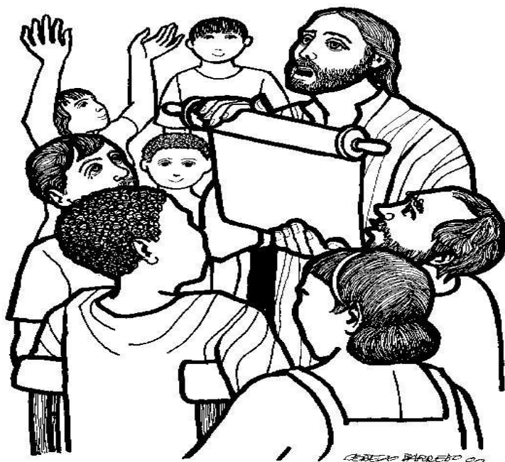
Good News to the Poor

Jesus read from the scroll: 'He has sent me to bring the good news to the poor, to proclaim liberty to captives, and to the blind new sight, to set the downtrodden free, to proclaim the Lord's year of favour'. Then he said: 'this text is being fulfilled today, even as you listen'. This is surely the clearest statement about the purpose of the Church and of our part in it that could be made. We don't just have a faith that is for us to make us comfortable. We have a power to transform the world we live in and living our faith is about doing just that. Our homes are to be places where each person finds healing and affirmation. The same has to be made true of the faith community we belong to. It is time to move away from a sense of duty in regard to our faith and move into a sense of adventure for the Kingdom of God.