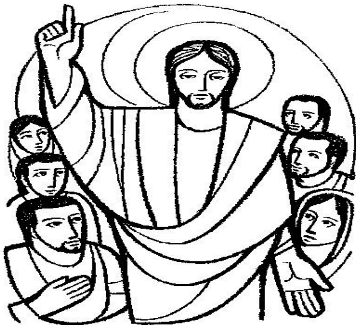
The Ways of the Lord

"Follow me and I will make you into fishers of people." Those words of Jesus, which are given to us for this week, are usually thought of as being addressed to people with a vocation to the priesthood or religious life. They are about vocation certainly but are addressed to each of us. The four great vocations in the Church are single life, married life, religious life and priesthood. All of us who are baptised are living one of those and each of us is vital to the health of the whole body, the Church. We live our vocations in different ways but to the same end, the salvation of the world. Our task is to discover how to live our own vocation to the full. This means discovering how to make our love radiate out to those around us. We begin in our homes with those who are closest to us. Then we can reach out to the world around us. When we are with Christ and following him love will be the characteristic of our lives. Fr. Johnny Doherty, C.Ss.R.