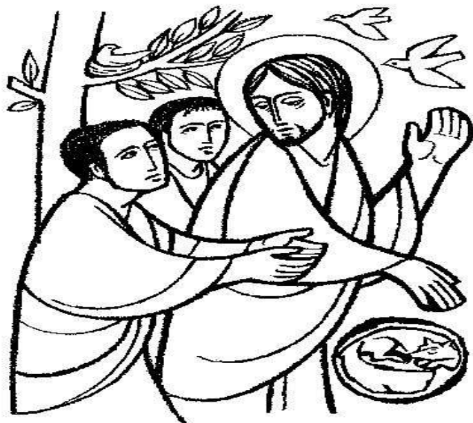
The Lord We Serve

Jesus said: "Once the hand is laid on the plough, no one who looks back is fit for the kingdom of God". We live in a world in which people are finding it increasingly difficult to make a full commitment to anything. This is probably the single most important reason for many of the social ills of our society. Jesus tells us that commitment is essential to human fulfilment, the kingdom of God. When a couple gets married they are looking ahead but tend quickly to look back to what each had and so set limits to their relationship. When a couple conceive a child they look forward to the birth. Then they begin to look back to the freedom they had beforehand and try to reclaim as much of that as possible. And in parish life many people want a full part in the future of the Church but are often unwilling to commit themselves to the work involved in ensuring its success.