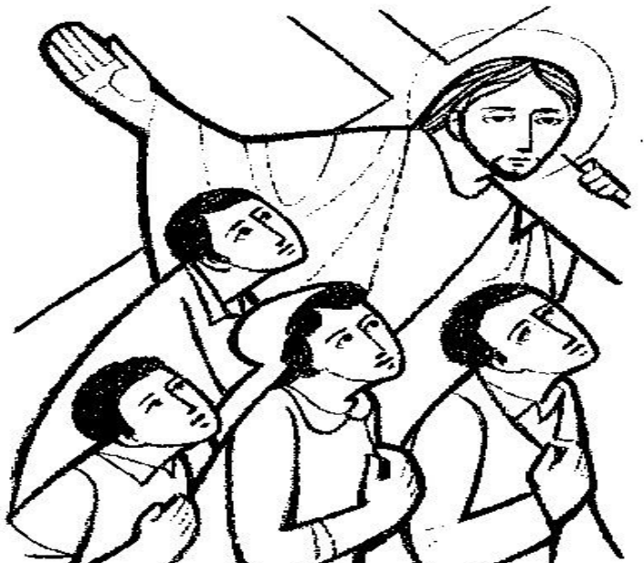
The Strength of Christ's Spirit

"What will you gain if you win the whole world and ruin your life?" Our society promotes three things as the sources of human happiness and fulfilment: positions of importance and power; money and possessions; continuous pleasure. Obviously all of these are important for the human person. But, when they become the reason for living, they are full of false promise. Jesus calls on us to put our trust in the important things of life, especially love, and to find there our true fulfilment. We engage in this struggle in all kinds of ways but especially in matters of love and faith. Spending time at prayer, either personal or as a community, can be seen as wasting opportunities for other things that could bring us rewards. Giving time to one another in marriage and family life is often done reluctantly because of what we might be missing. And yet these are the really important things of life.