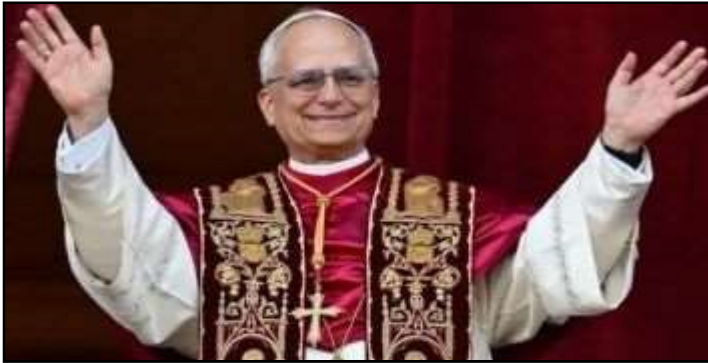
POPE LEO XIV

As I write this piece the Conclave is just about to begin. Maybe by the time you read this the election of our next Pope will already be over, meaning that someone will have received the 90 votes necessary. Whenever that happens, whoever the "successful" candidate is, he needs our prayers.